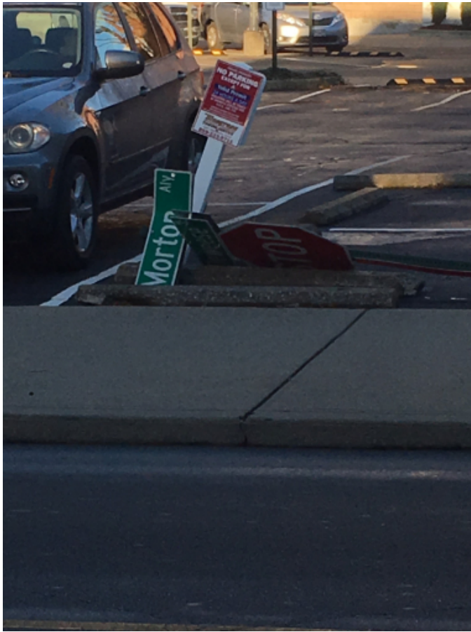
REPORT ISSUES TO CITY SERVICES