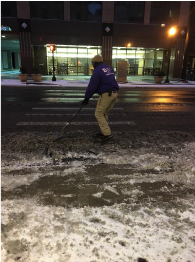
Removing Snow From Ramps