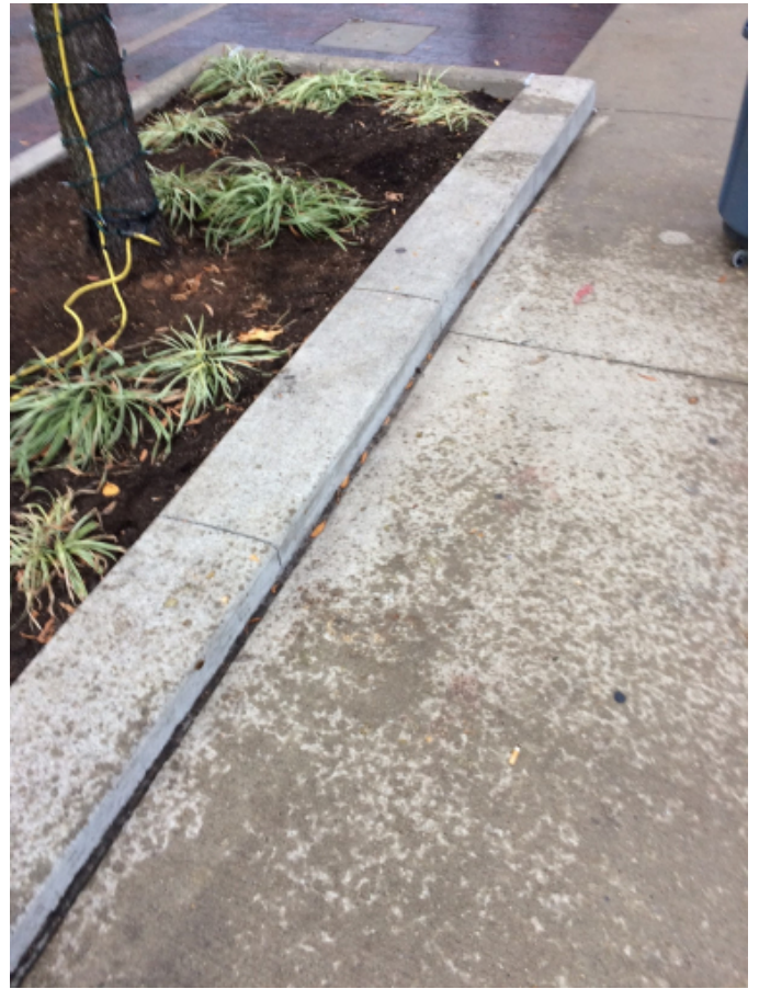
MAIN ST. IN FRONT OF THE LIBRARY