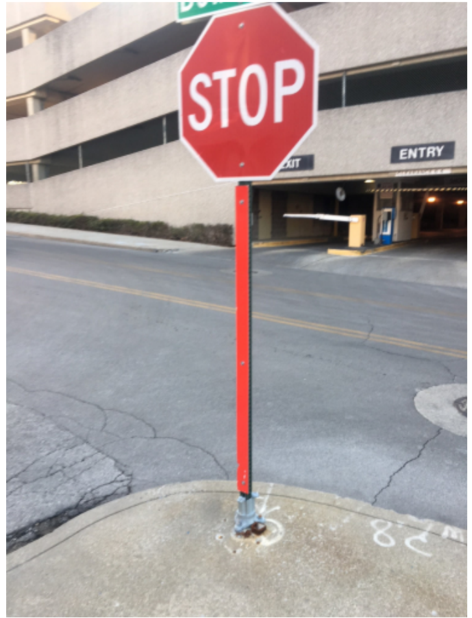
CHECK TO SEE THAT REPAIRS HAVE BEEN MADE