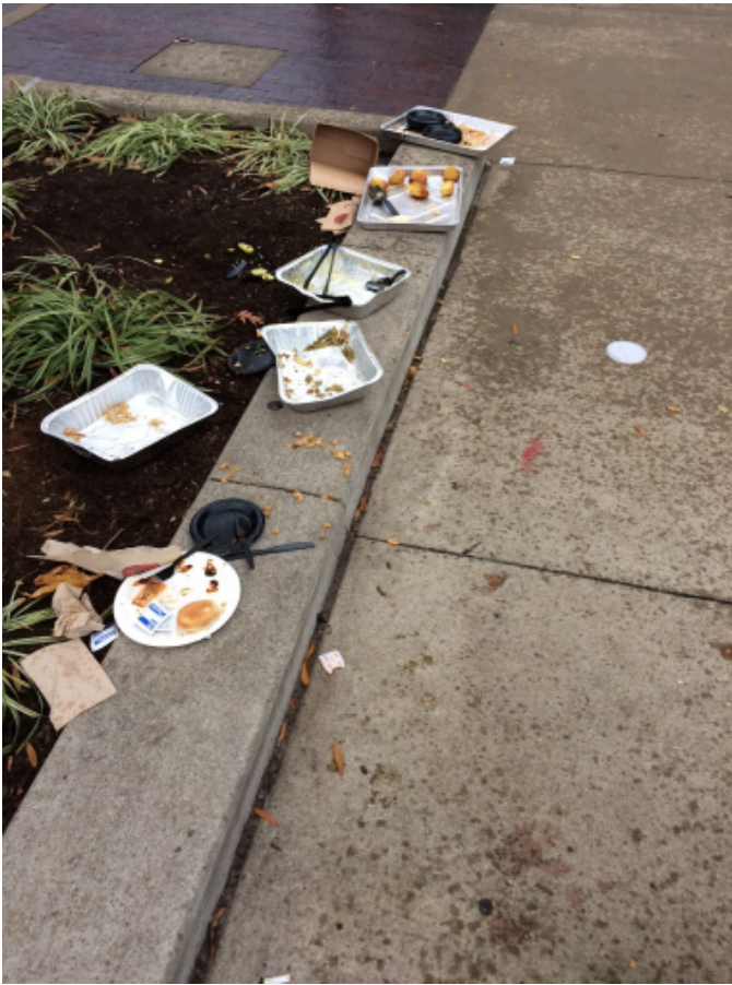
MAINTAIN CLEANLINESS DOWNTOWN