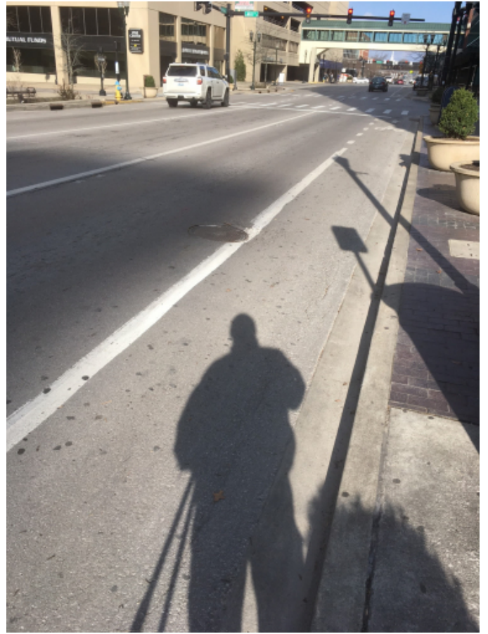
BROADWAY AND MILL STREETS